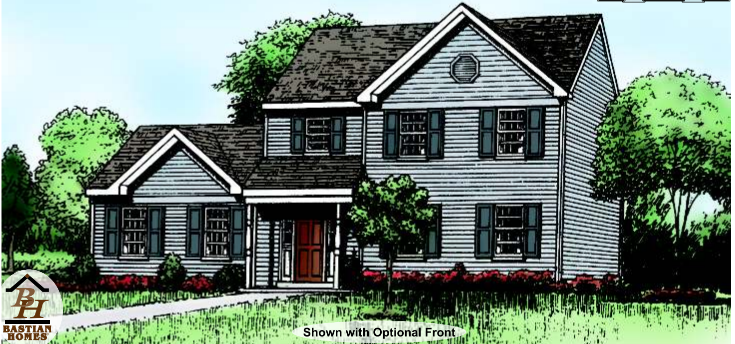
Shown with Optional Front