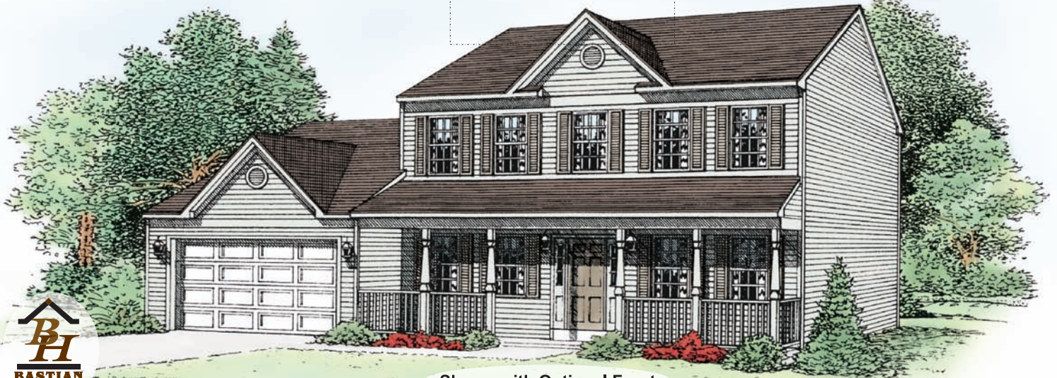
Shown with Optional Front